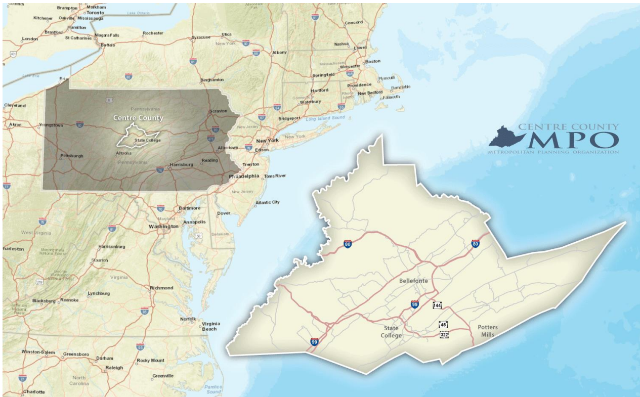
Centre County, Pennsylvania