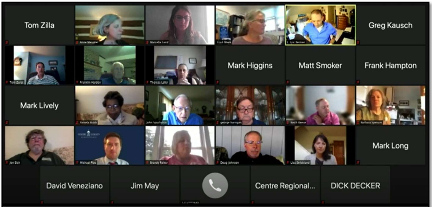
CCMPO Coordinating Committee – May 2021