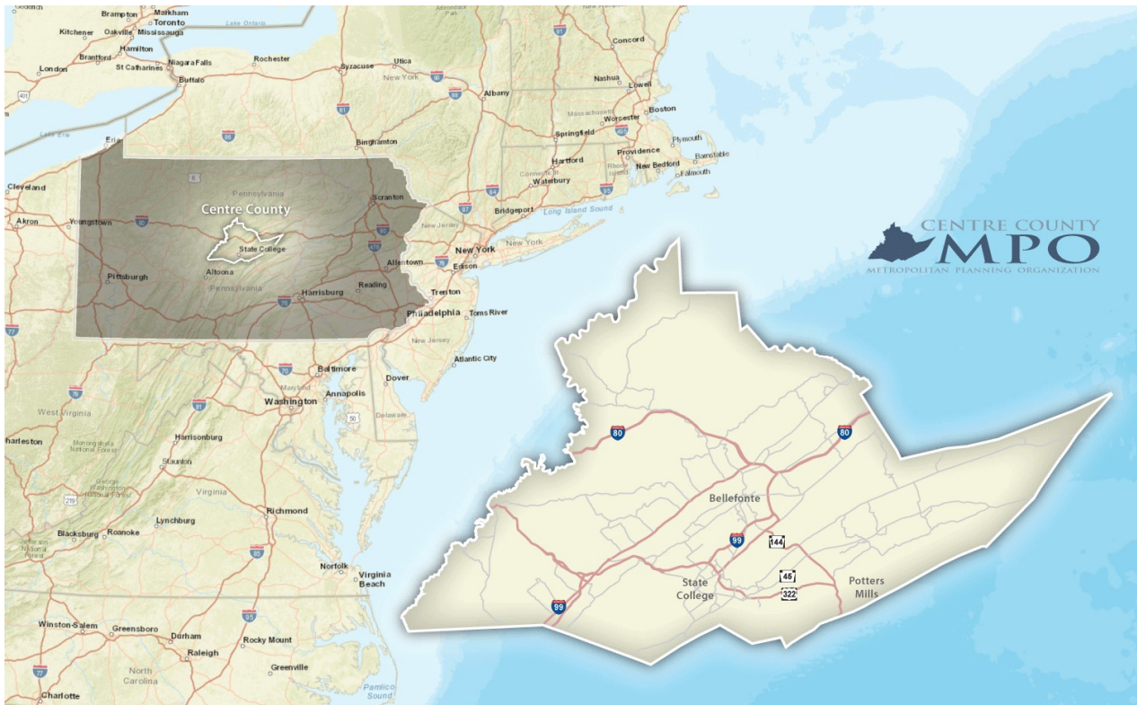
Centre County, Pennsylvania