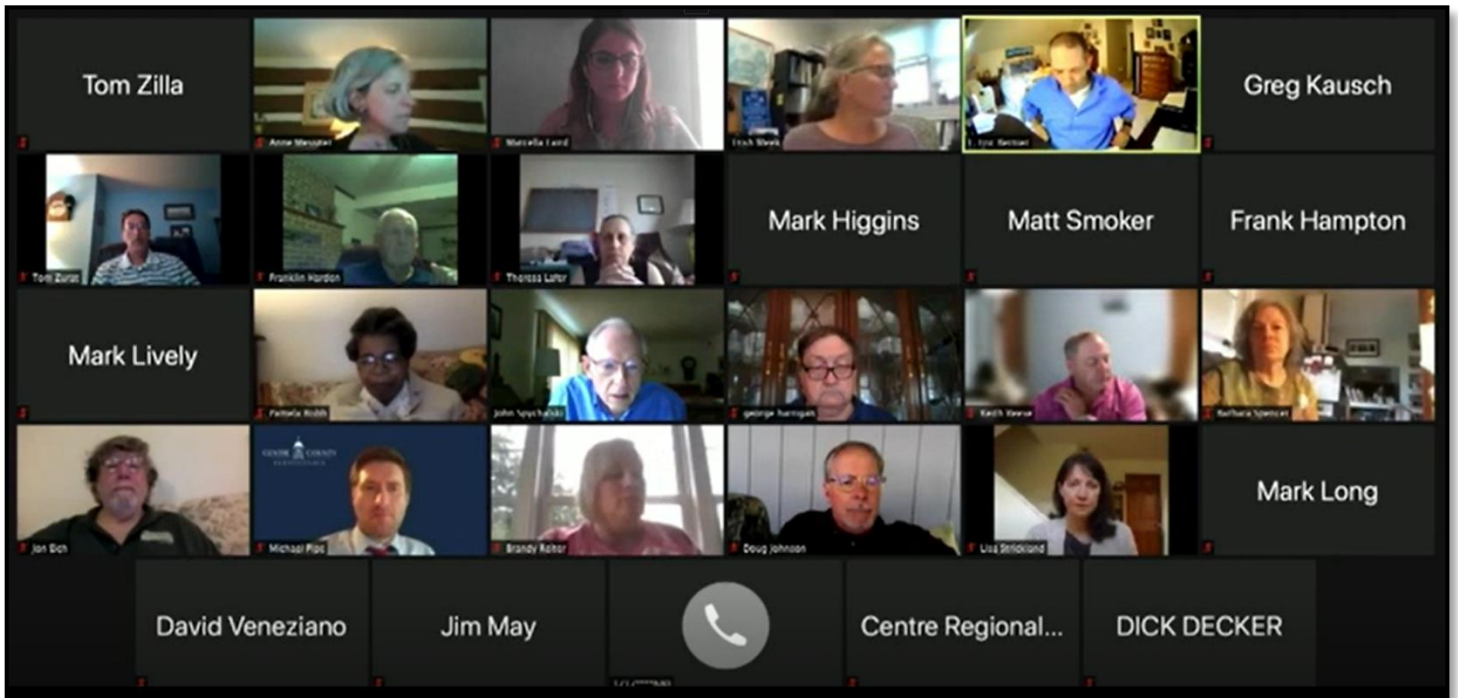
CCMPO Coordinating Committee – May 2021