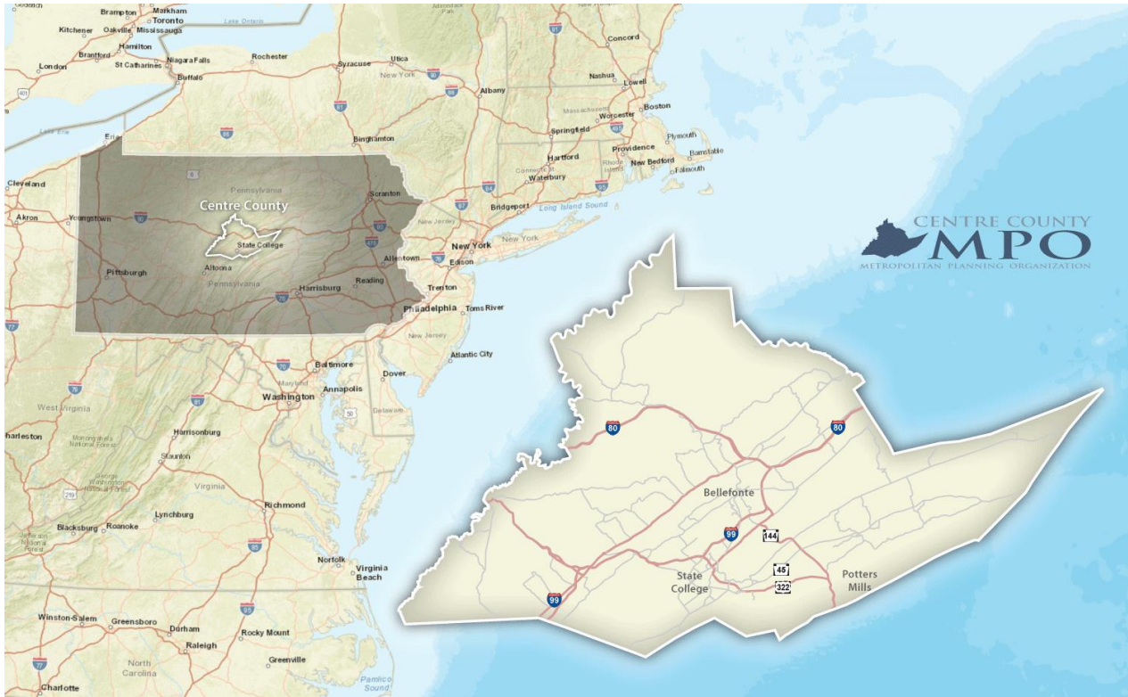
Centre County, Pennsylvania