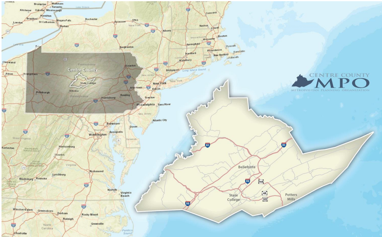
Centre County, Pennsylvania