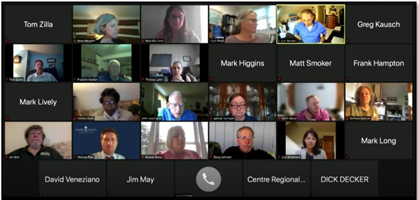
CCMPO Coordinating Committee – May 2021