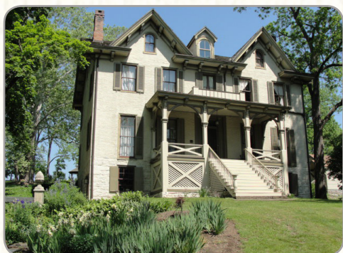
The Centre Furnace Mansion in College Township once served as the Centre Furnace ironmaster's residence. Today it is home to the Centre County Historical Society and is open to the public for tours.

GOAL 3 - The Centre Region's community identity, history, and culture are maintained.