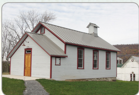
The Rock Hill School in Harris Township is located in the Linden Hall National Historic District.

The Centre Region is fortunate to have a variety of historical and cultural resources that date from multiple periods in the Region's history. Historic resources include structures, districts, and landmarks. Cultural resources include archaeological sites that may be either historic or prehistoric. Historic and cultural resources serve as reminders of the Centre Region's past, connecting it with its cultural heritage and allowing a better understanding of the people and events that shaped the patterns of its development. Preservation of these resources ensures that they continue to play an integral and vital role in promoting the culture and character of the community. The goals of this Element of the Comprehensive Plan are focused on identifying and actively preserving historic resources throughout the Region as well as educating the public about the significance of such resources.