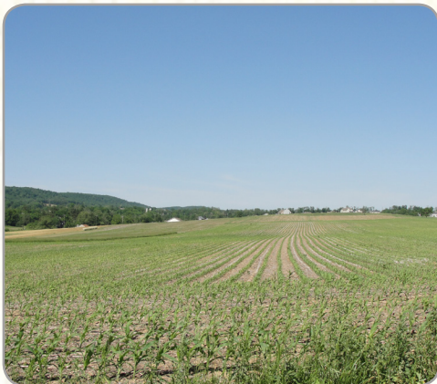
Preservation of prime agricultural soils helps maintain agricultural production in the Region.