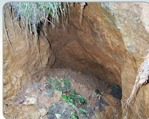
Minimizing surface water discharge to sinkholes helps protect groundwater resources.

Utilize existing mapped public source water protection areas as a factor when considering significant new or proposed development and infrastructure to evaluate potential risks to groundwater quality.