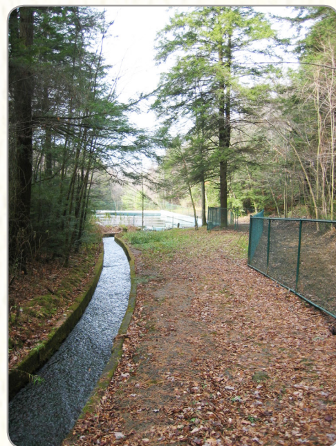
Protection of surface water resources, like this reservoir in Shingletown Gap, ensures that clean drinking water can be provided to Centre Region residents.

Discourage intensive development activity from occurring on highly erodible soils and steep slopes to prevent excessive erosion that can affect groundwater quality.