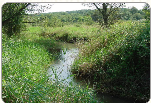
Protection of wetlands and other natural areas provides habitats for a variety of wildlife.

Revise municipal regulations to provide adequate development buffers adjacent to important ecological areas in the Centre Region.