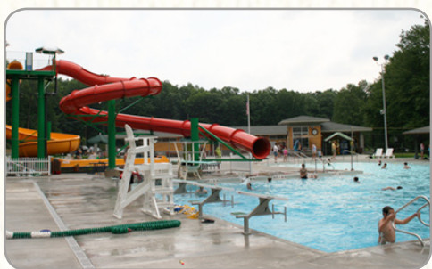
Park Forest pool in Patton Township is one of two pools operated by Centre Region Parks & Recreation department.