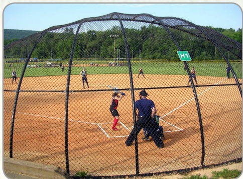
The Hess Softball Field Complex in Harris Township is an example of parklands resulting from regional collaboration.