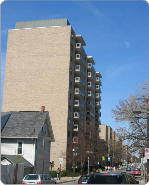
Large residential buildings in Downtown State College provide housing for students within walking distance of campus.

GOAL 3 - Adequate housing opportunities and options exist within the Centre Region for Penn State University students who choose to live within the Centre Region.