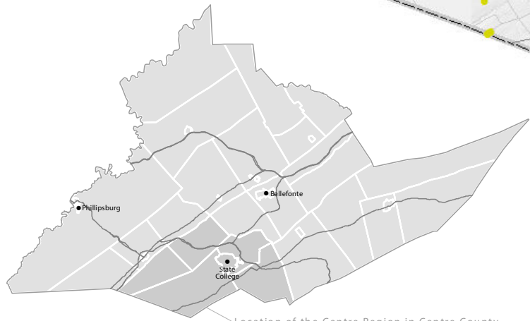
Location of the Centre Region in Centre County