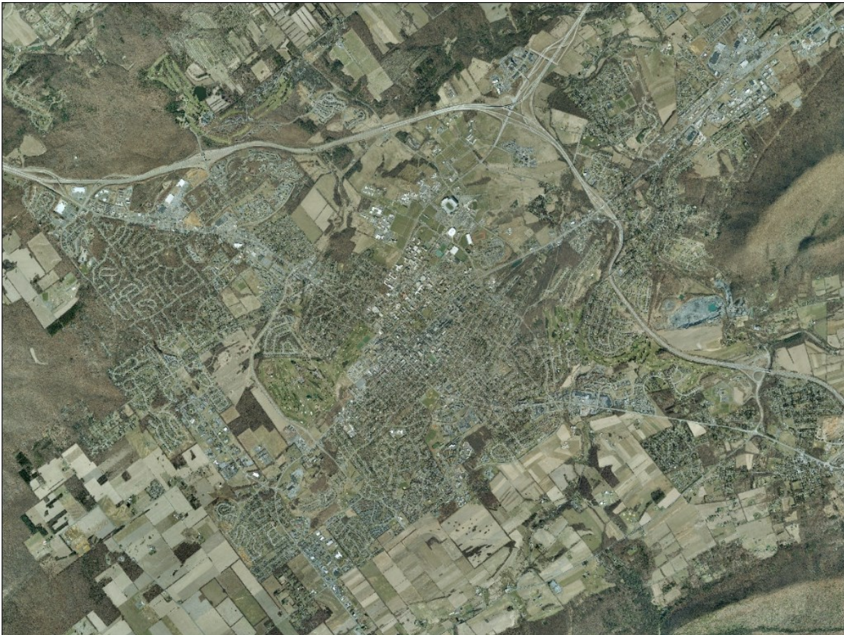
Since the mid-1960s, the six Centre Region municipalities have cooperatively planned for growth and development in the region. Planning for land uses and public services at a regional scale has helped to reinforce efficient land use consumption along with cost effective public services.

Due to the growth pressures experienced by the Centre Region along with its shared public services, planning for land use at a regional scale helps to reinforce efficient land consumption along with cost effective public services. By cooperatively planning for growth, the six Centre Region municipalities have avoided costly extensions of public services and have helped preserve open space and farmland. This approach to planning has and has resulted in a community that is regarded for its high quality of life.